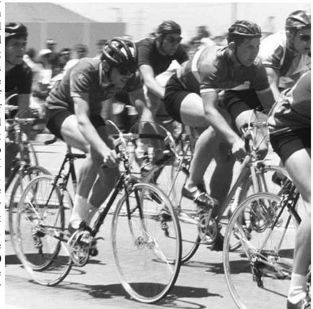
Riding with the Big Boys - Somerville Criterium, Age 16