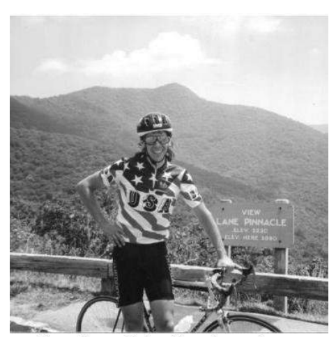
Showing off the New Laundry