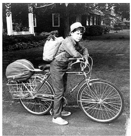
Over night solo ride to O.C. - Age 9

At 9 my parents let me take an overnight 120some bike tour from home to Ocean City, sleeping under the stars in the Pine Barrens. By 12 I was racing, by 13 winning. In '71 Dad said